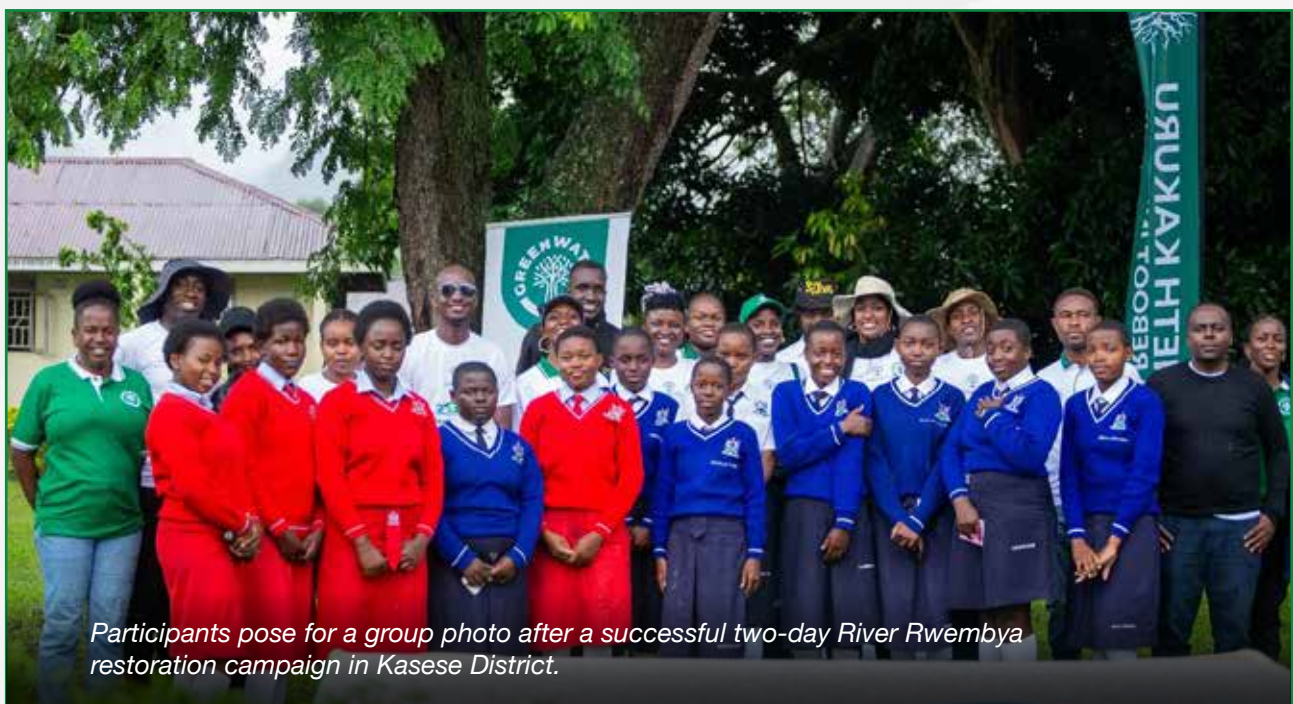
Participants pose for a group photo after a successful two-day River Rwembya restoration campaign in Kasese District.

This experience highlighted the critical role of legal professionals in driving environmental justice, and the importance of engaging youth in conservation.