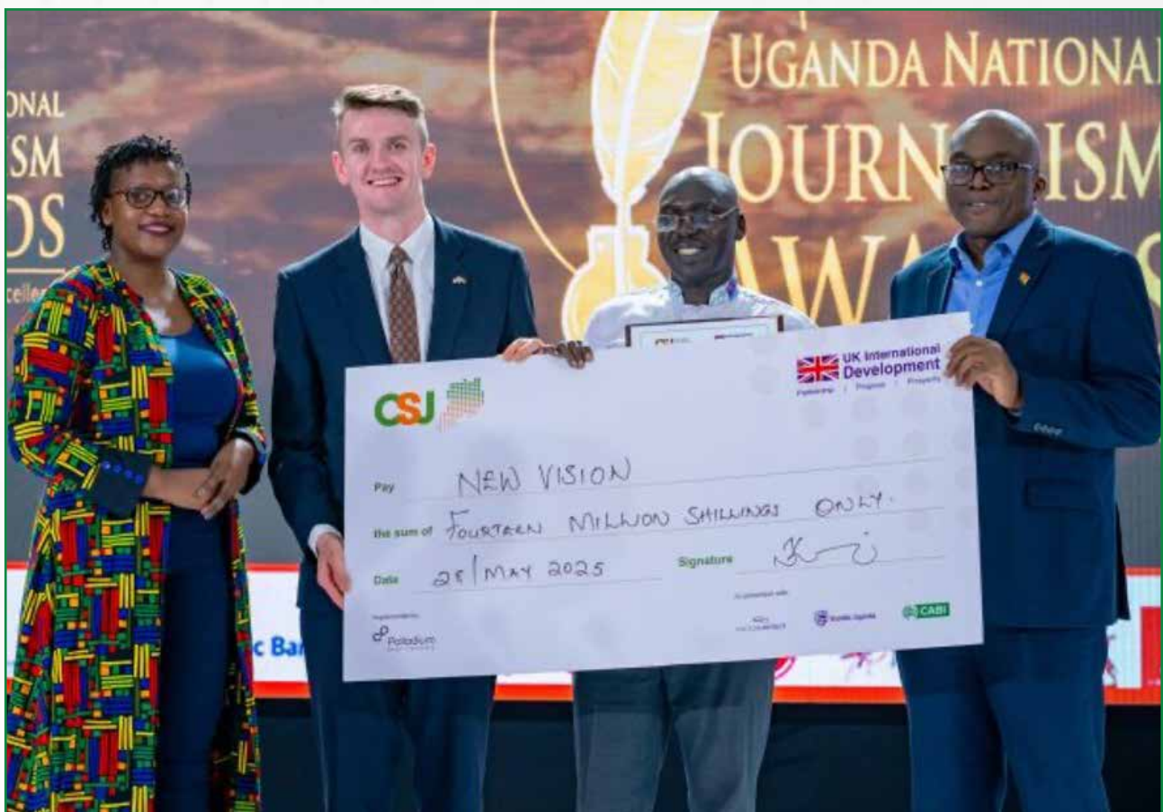
New Vision editors accept the first-place Institutional Climate Change Reporting Award from representatives of the British High Commission and Climate Smart Jobs.