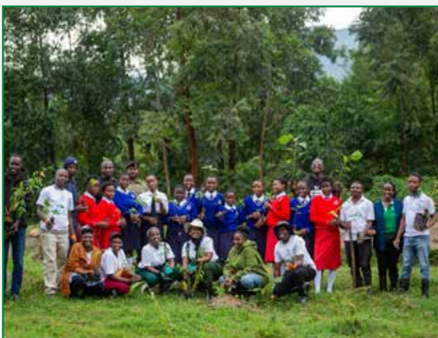
Participants hold tree seedlings during the River Rwembya restoration event